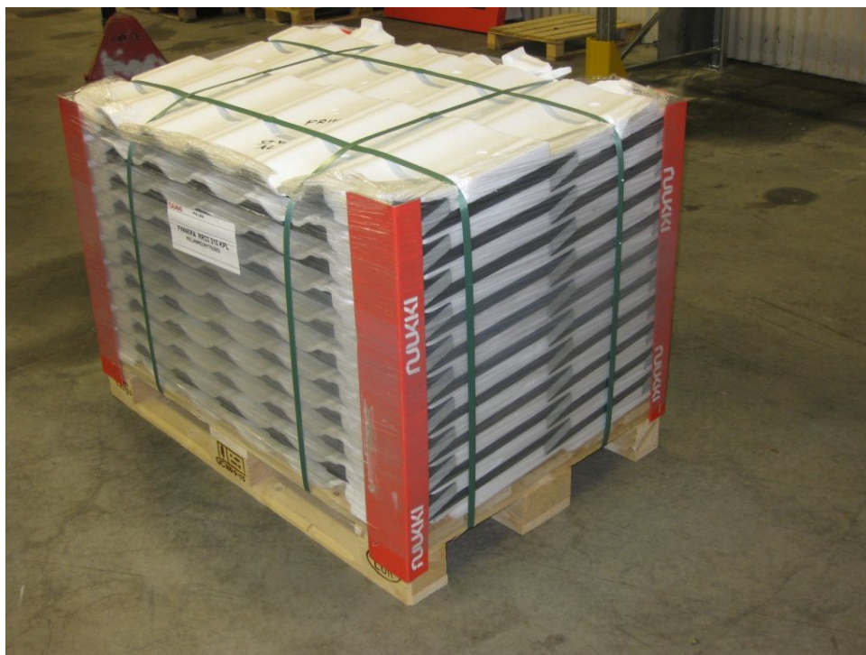
Picture 2 Picture of Finnera standard europallet. A batch contains 310 pieces of Finnera modules loaded on a standard europallet. The package is constructed so that 31 Finnera pieces are laid on top of each other, then an EPS-piece is inserted and the sequence is continued similarly so that there are 10 layers on the pallet. After stacking the modules and intermediate pieces, the stack is strapped, plastic wrapped and corner protection shields are inserted.

Packaging: Sheets will be packed on a standard wooden europallet, size of which is 1200 x 800 x 900 mm. See picture 2 below. Package includes strapping, wrapping and corner shields.